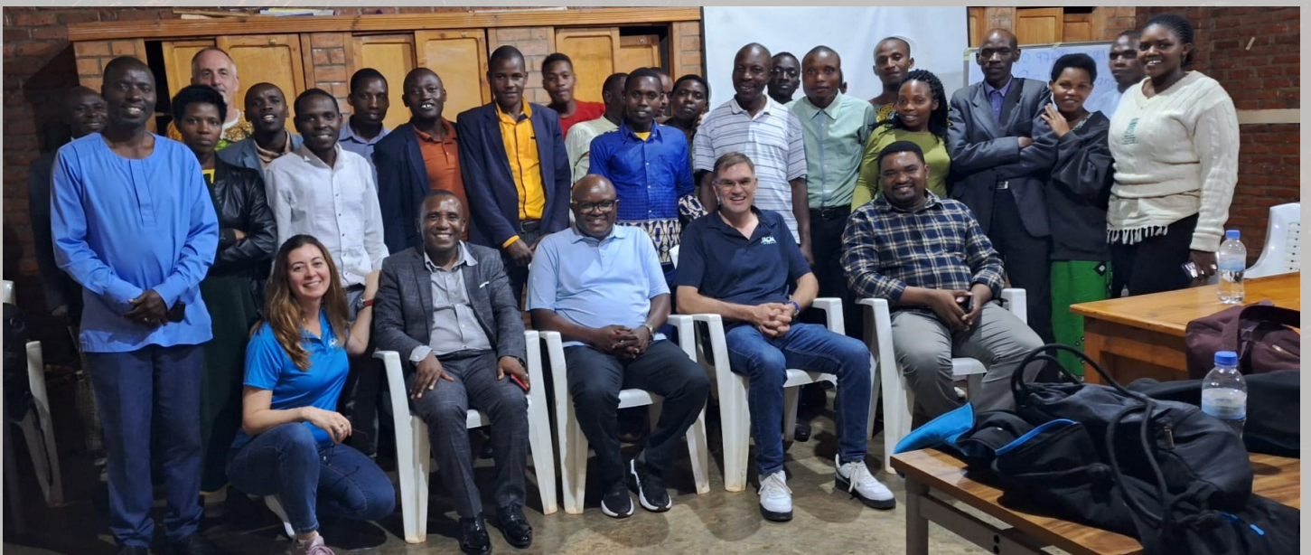
Inkuru Nziza church leaders and students in Kigali, Rwanda

In Rwanda the government has passed legislation that requires all pastors and leaders of churches to have an accredited ministry or theology degree by the end of this year, otherwise the churches without accredited leaders could be closed. Currently we have 25 students who are half way through their Diploma and another 30 who are commencing in 2024. Please pray with us that the government may give us more time to train our leaders and for more students to be trained to lead our churches.