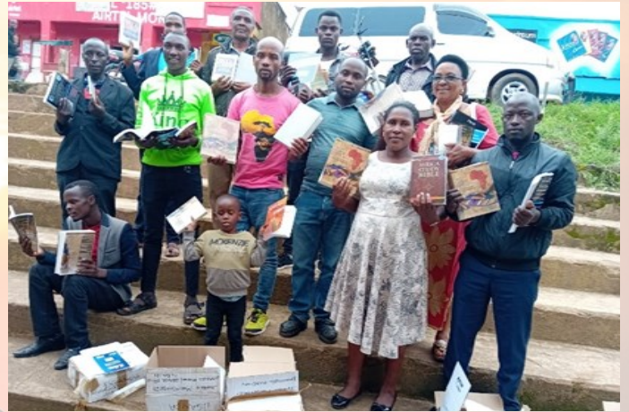
Students in Uganda receiving book packs from Opal Trust