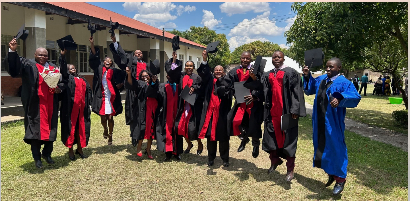
GLO-Zambia Diploma of Theology Graduates, Ndola, Zambia, 2023

The African Brethren Training Network (ABTN) also convened in Ndola, Zambia, at GLO-Zambia, in November 2023. The group experienced firsthand the graduation ceremony, diploma and degree training, and received administrative, educational, and theological professional development. Together with the students they considered the theology of the Holy Spirit, Biblical Theology, and African Cultural Issues. Delegates from Nigeria attended ABTN for the first time to consider commencing training in 2024.